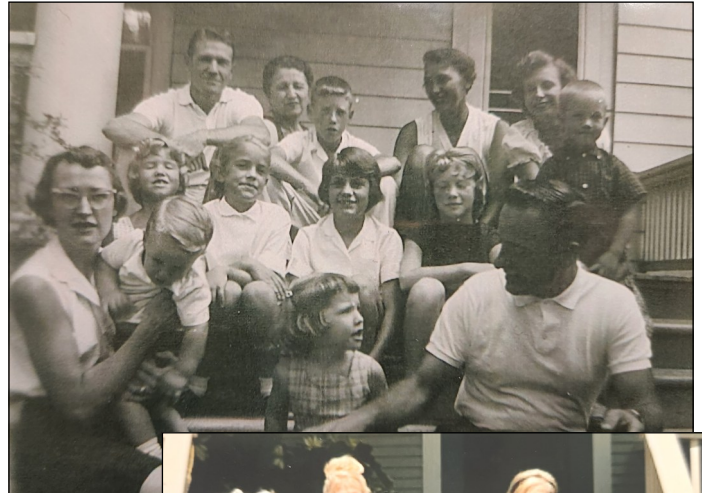
Read family, 1959

Six of those ladies with connections to the Read family (pictured below) visited the Schulzes' house on Grove Street last summer, cherishing stories and memories of past family.