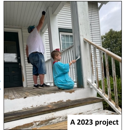
A 2023 project

It's just people helping and caring for people.